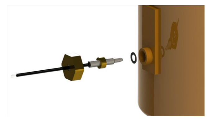
Fig. 1 - Mounting example with sealing ring and screw.