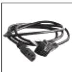
EU+UK/US depending on region