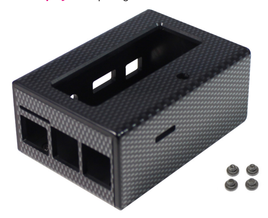
Raspberry Pi B+ and PiFace Control and Display assemblies not included